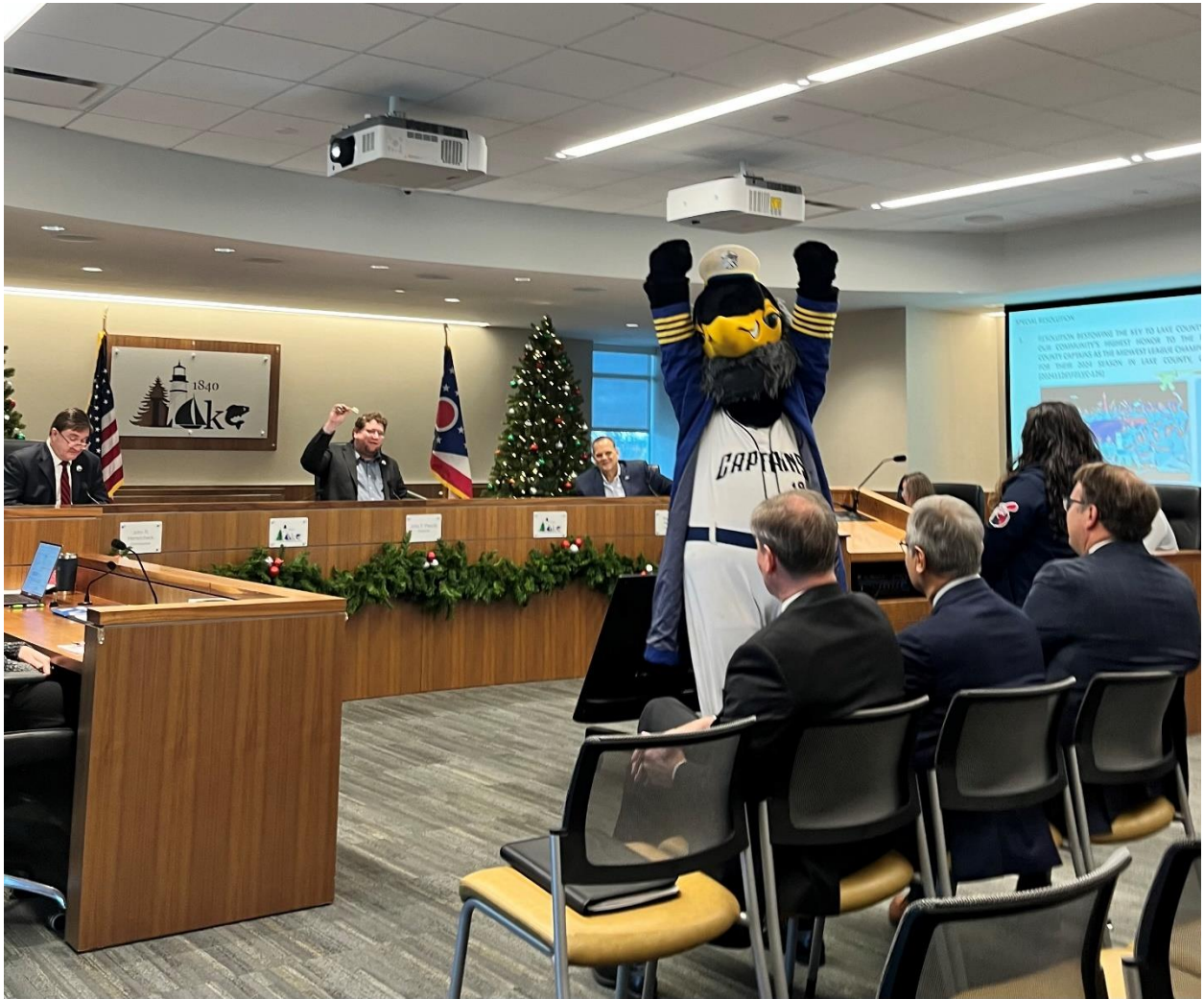
4 Horatio celebrating receiving the Key to the County.